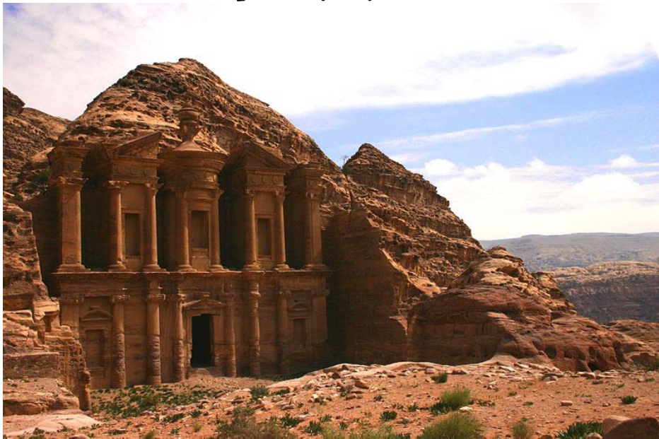
Monastery at Petra