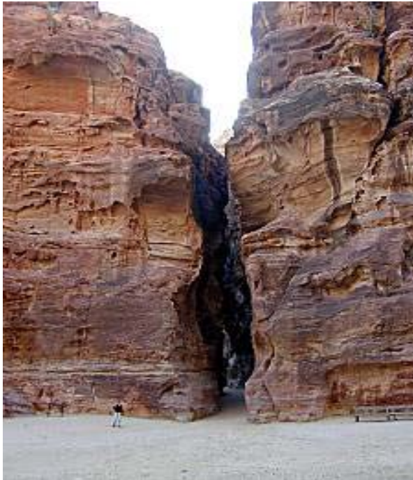
The Siq--Entryway into Petra