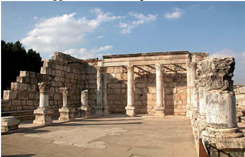
Actual Synagogue where Jesus worshipped in Capernaum