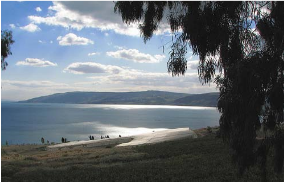
Sea of Galilee from the Mt. of the Beatitudes