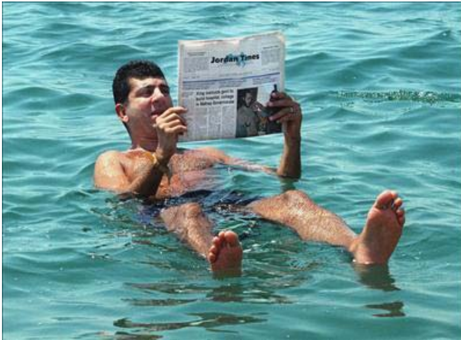
Floating in the Dead Sea