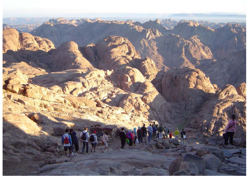
Climbers on Mount Sinai