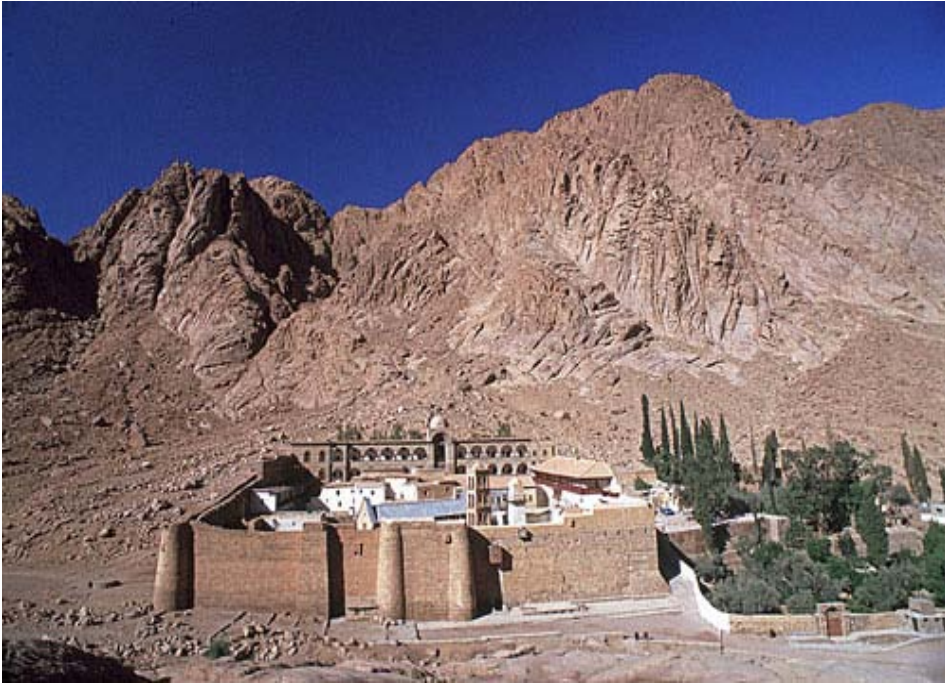
St. Catherine's Monastery at the foot of Mount Sinai