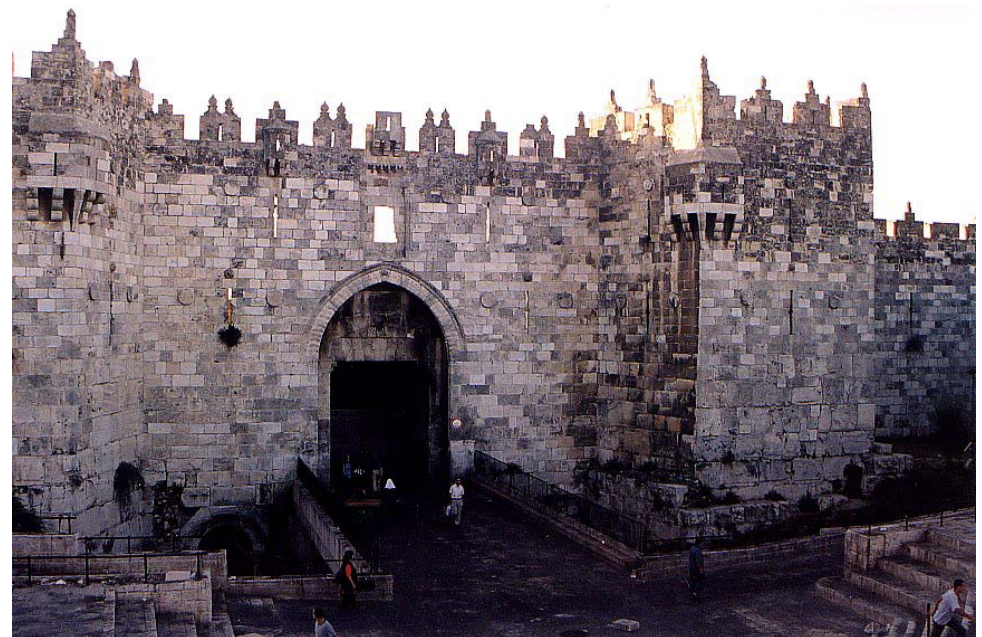
Damascus Gate in Old City of Jerusalem