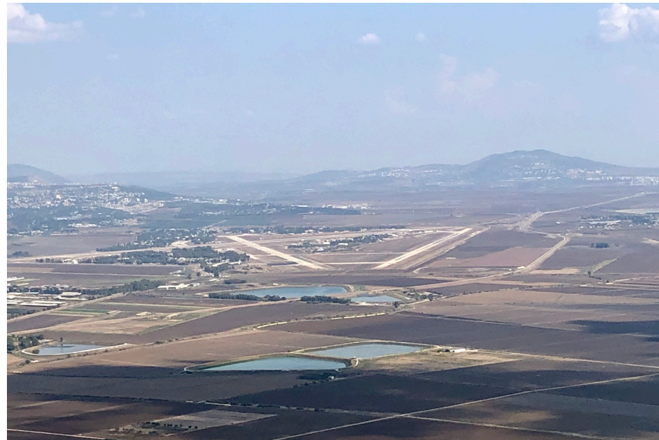
Valley of Armageddon from the top of Mt. Carmel (1 Kings 18)