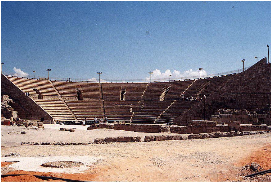
Theater at Caesarea from Jesus' day