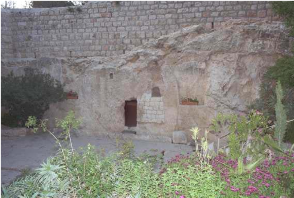
The Garden Tomb