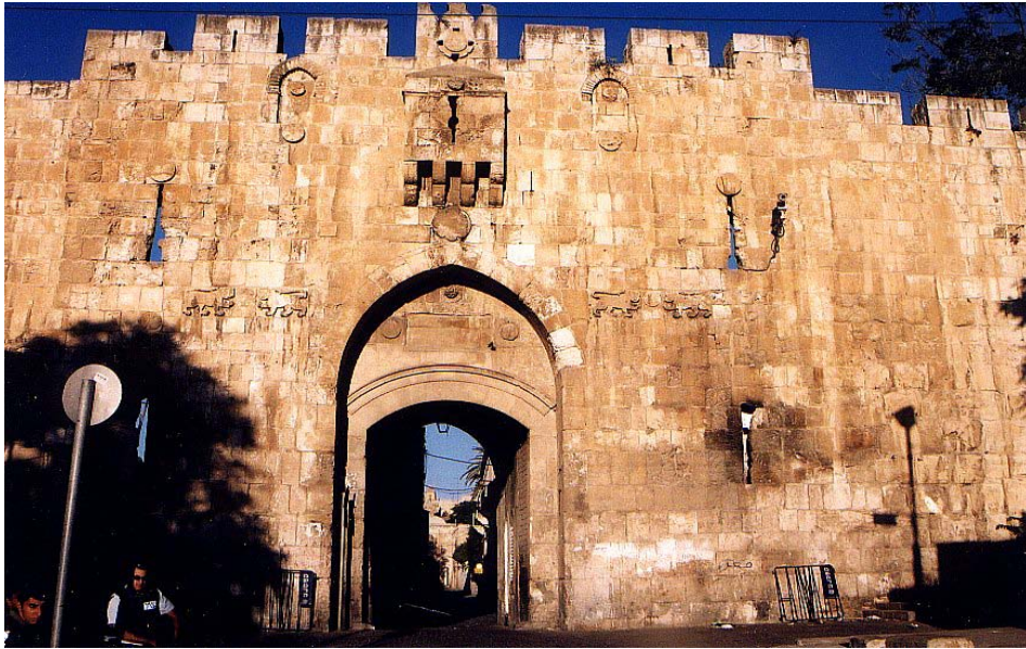
Lion's Gate where Stephen was martyred (Acts 7)