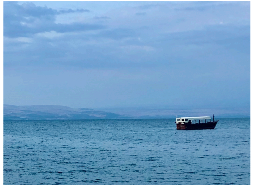
Sea of Galilee