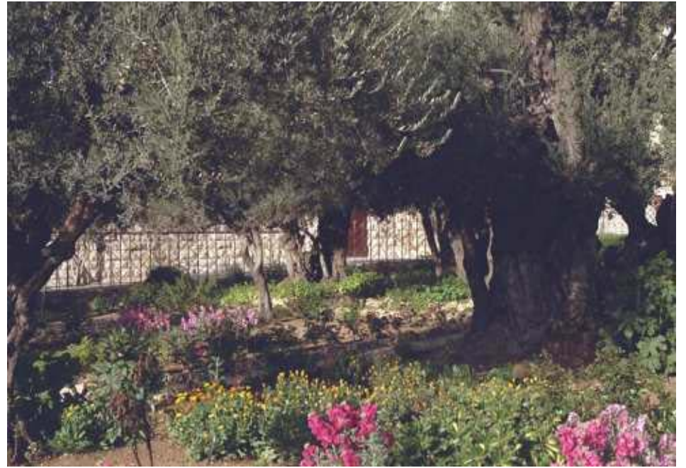
Garden of Gethsemane