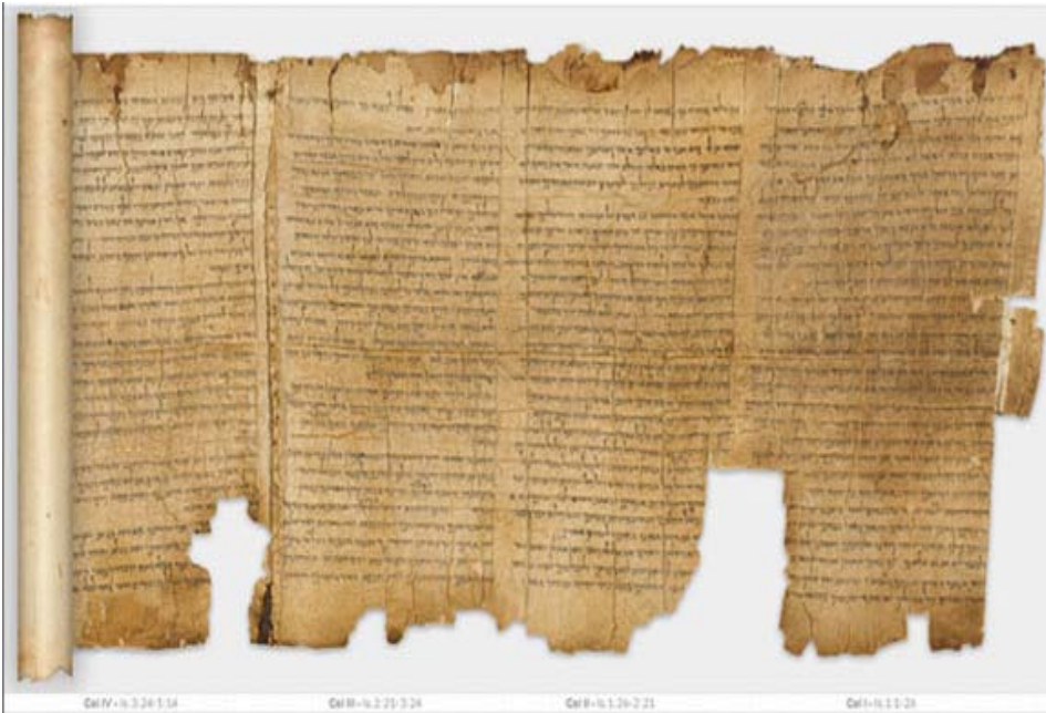
Great Isaiah Scroll from the Dead Sea Scrolls