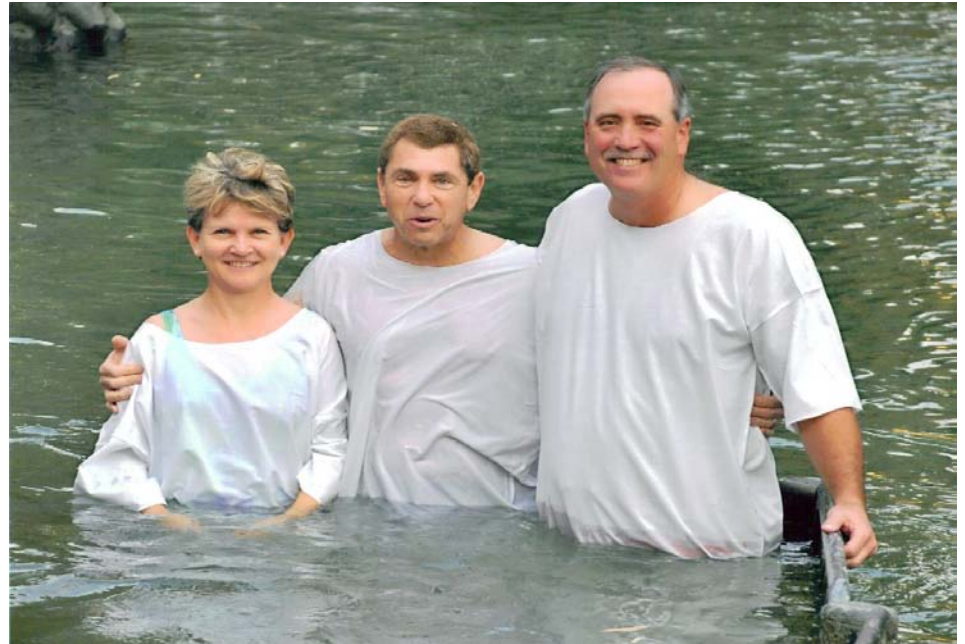
Baptism in the Jordan River