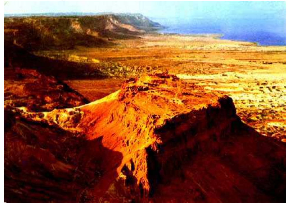
Masada at Sunset with the Dead Sea in the distance