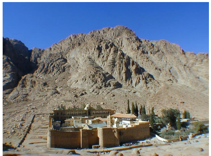
St. Catherine’s Monastery and Mt. Sinai

Oct 28, 2020 – We rise early and after breakfast set out for Mt. Sinai. We begin by visiting St. Catherine’s Monastery at the base of Mt. Sinai, some 4000 feet above sea level. This monastery was first built by Helena, mother of Emperor Constantine in the 4 th century AD. The monastery serves as the repository of some of the oldest mosaics, most exquisite icons and most precious manuscripts in all of Christendom. After visiting the monastery and having lunch, we will walk part way up Mt Sinai to get a beautiful panoramic view of the top of the mountain where God gave Moses The Ten Commandments, and at the valley below where the Israelites were camped for eleven months. Then we return for dinner and overnight at the deluxe hotel in Eilat.