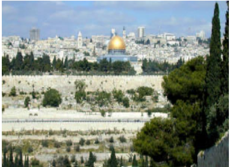
Dome of the Rock from the Mount of Olives

Oct. 24, 2020 – After a great breakfast, we will travel to the private courtyard at the Garden of Gethsemane, overlooking the Temple Mount. There will be time here for worship, devotions and prayer led by Lon. From here, we will walk across the road into the Garden of Gethsemane itself, where we will see olive trees that were actually alive on the night Jesus prayed here. From here we go to the Wailing Wall and the Temple Mount. We will see "The Beautiful Gate" where the events of Acts 3 took place. Lon will share a devotional here. Then, situation permitting, we will proceed onto the Temple Mount where Lon will discuss with us the rebuilding of the Jewish Temple and its implications for the Second Coming of our Lord Jesus. After lunch, we will visit the new archaeological excavations at the base of the Temple Mount, where Lon will share a message and you will get to see some of the very stones from the Jerusalem temple destroyed in 70 A.D. After a great day, dinner and overnight at our deluxe hotel.