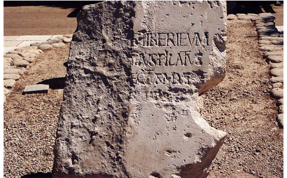
Pontius Pilate stone from Caesarea