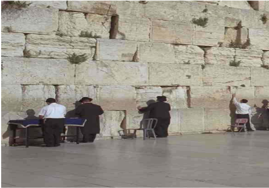
Worshippers at the Wailing Wall in Jerusalem