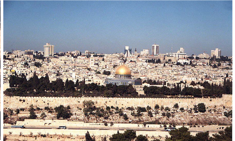
Temple Mount from the Mount of Olives