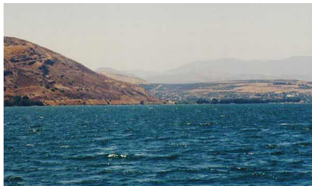
The Sea of Galilee

Oct. 23, 2020 – After a hearty Israeli breakfast overlooking the beautiful sunrise on the Sea of Galilee, we head off to the East side of the Sea of Galilee to Kursi. This site is in the ancient "Land of the Gadarenes" mentioned in Mark 5 and was the home of the demon-possessed man named Legion. It was here that Jesus cast the demons out of this man and into the herd of swine. Lon will share a devotional at the quaint little church on this spot. From Kursi we proceed to the amazing excavations just south of the Sea of Galilee at the ancient city of Bet Shean. Bet Shean was a significant city in Palestine since the time of Abraham and is mentioned in the records of Pharaoh Thutmosis III as a city he conquered on his Canaan campaign in 1468 BC. It figures prominently in a tragic episode from the Bible, when the Philistines took the beheaded bodies of King Saul and his son Jonathan, and hung them on the city wall of Bet Shean (1 Sam. 31:8-10). Under Greek and later Roman rule, Bet Shean became a wealthy and influential city, as evidenced by the impressive remains from this period, including a theater that rivals the one at Caesarea. We then drive to Jerusalem, the City of God, where we will sit on the Mount of Olives and look over at the breath-taking Temple Mount and Old City. Lon will share a message here focusing on the many biblical events that happened on the Mount of Olives. After a full day, we will have dinner and overnight at our deluxe hotel.