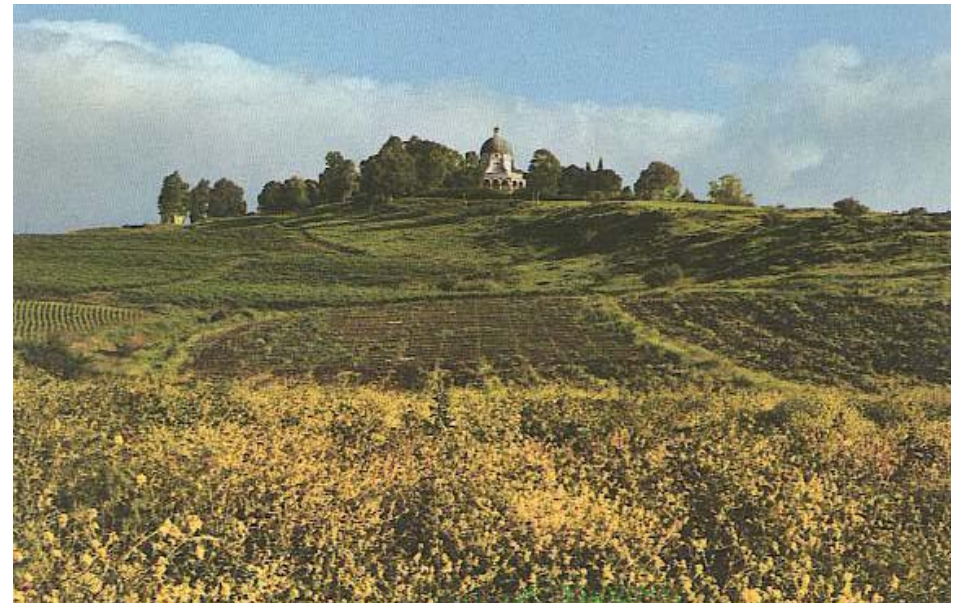
The Mt. of the Beatitudes